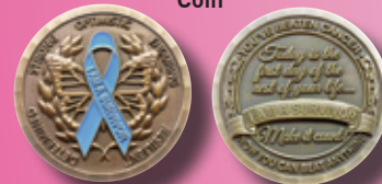
#CC-P Prostate Cancer Coin