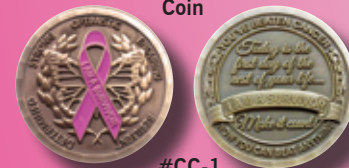
#CC-1 General Cancer Coin