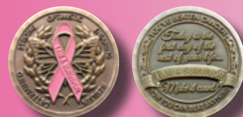
#CC-B Breast Cancer Coin

If you can beat cancer, you can beat anything Today is the first day of the rest of your life... make it count!